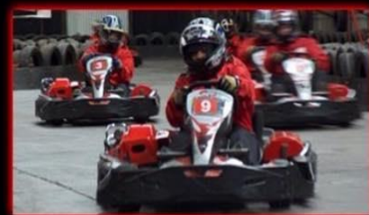
What people think we do