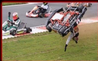
What our mums think