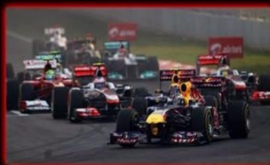
What we think we do