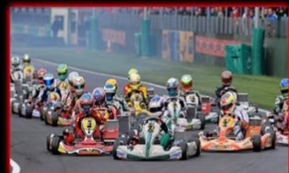
What we really do