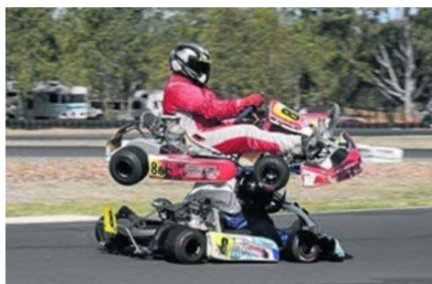
"I believe I can fly....."

Great photo, but just to confirm.... it is NOT Pete Baylis in the red kart...even though the spare tyre inside the overalls makes you think it is !!